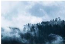
UK Research and Innovation