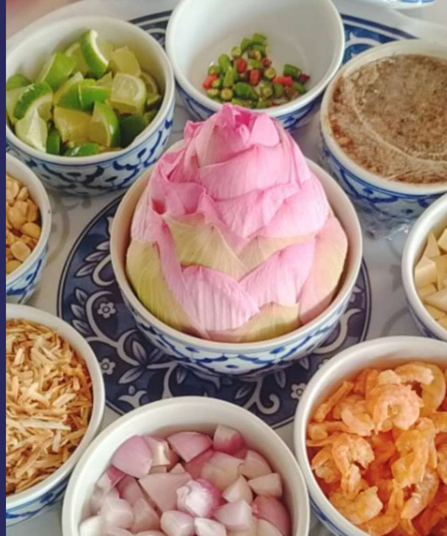
◀ Thai Cooking