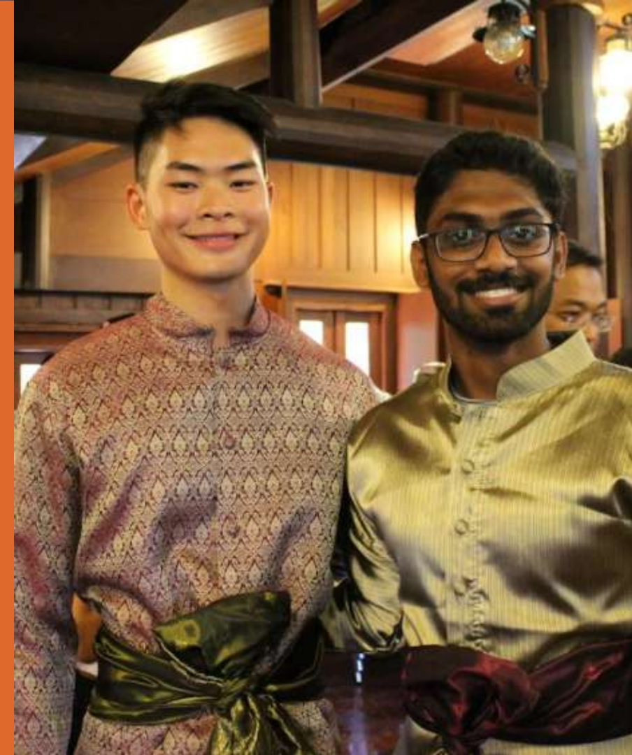
Thai Dancing ▶