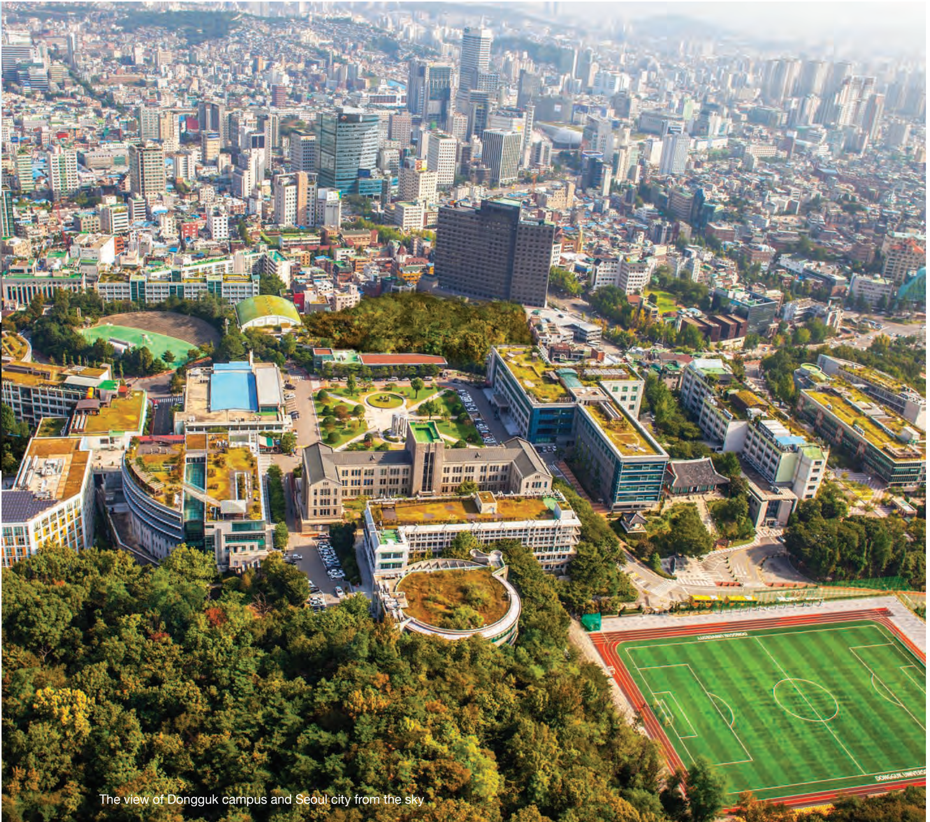
The view of Dongguk campus and Seoul city from the sky